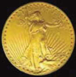
$20 Saint-Gaudens Double-Eagle (1907 - 1933)