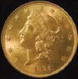
$20 Liberty Double-Eagle (1849 - 1907)