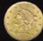
$2.5 Liberty Quarter-Eagle (1840 - 1907)