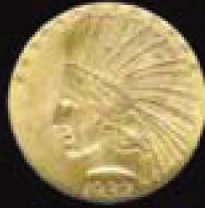
$10 Indian Eagle (1907 - 1933)