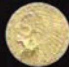
$2.5 Indian Quarter-Eagle (1908 - 1929)