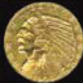
$5 Indian Half-Eagle (1908 - 1929)