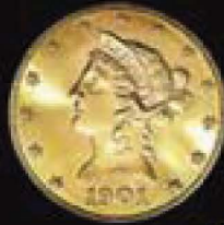
$10 Liberty Eagle (1838 - 1907)