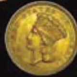
$3 Indian Princess (1854 - 1889)