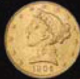
$5 Liberty Half-Eagle (1839 - 1908)